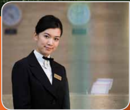
Home Concierge Service*