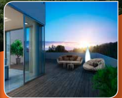
Skysuites & Penthouses