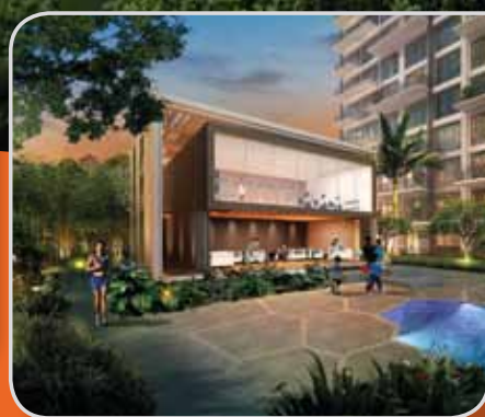
Clubhouse Gym & Function Suite