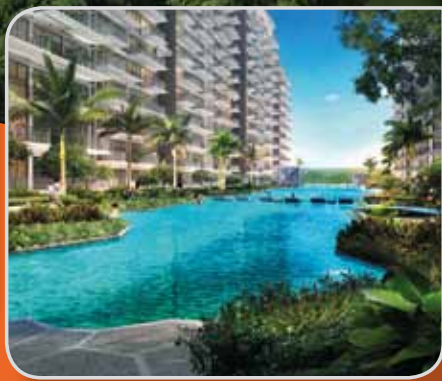
100m Infinity Pool